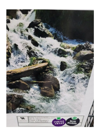
Anna Donahue Photography