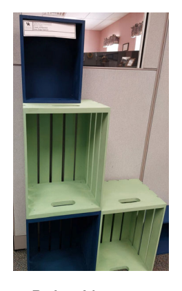
Paige Vanover Crate Bookcase