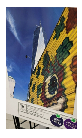
Anna Donahue Photography