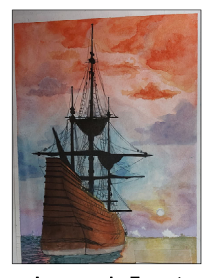
Annemarie Fuerst Reserve Grand Champ Arts & Crafts