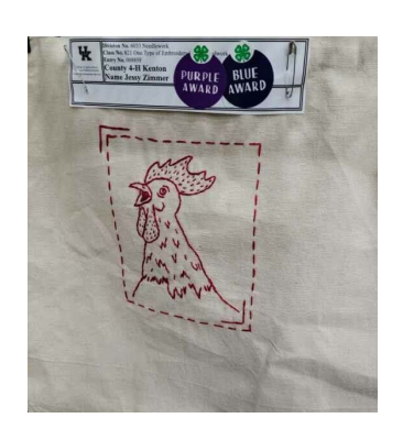
Jessy Zimmer Needlework