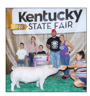
Bristol Hopkins Reserve Grand Champ Chester